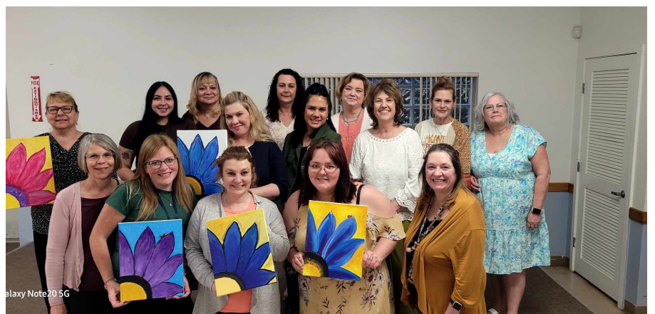
Chautauqua Child Care Council