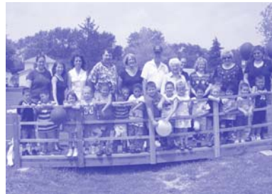
of Youth & Family Services.