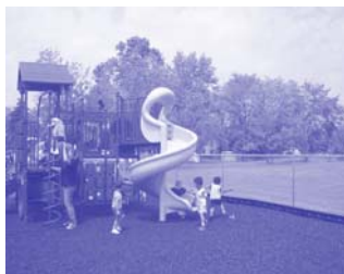
Head Start Students Playing on New Playground

There is nothing like the sounds of children's laughter to bring warmth to your heart and a smile to your face. Gleeful screams and joyful laughter could be heard as the gates opened on the new playground behind Holy Trinity RC Church.