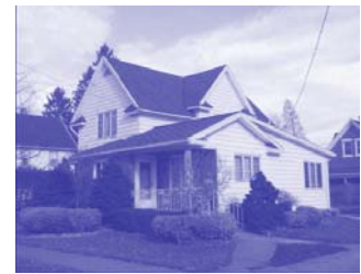
1st Time Homeowner's Home

Becoming a homeowner today has become increasingly more difficult. Through increased financial literacy skills, discipline, and perseverance, the dream of owning a home can become a reality.